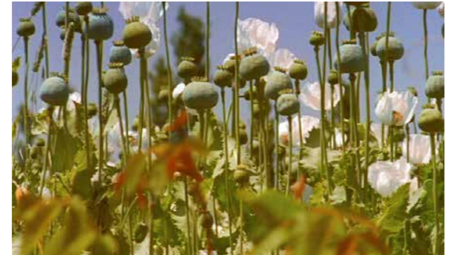
Mustafa Hulusi Afyon , 2009 Four screen video installation. Colour, sound. 29' 38". Variable sizes

human bodies makes it impossible to ignore the presence of certain ethnic subjectivities, not been related to the vindication of racial agency?