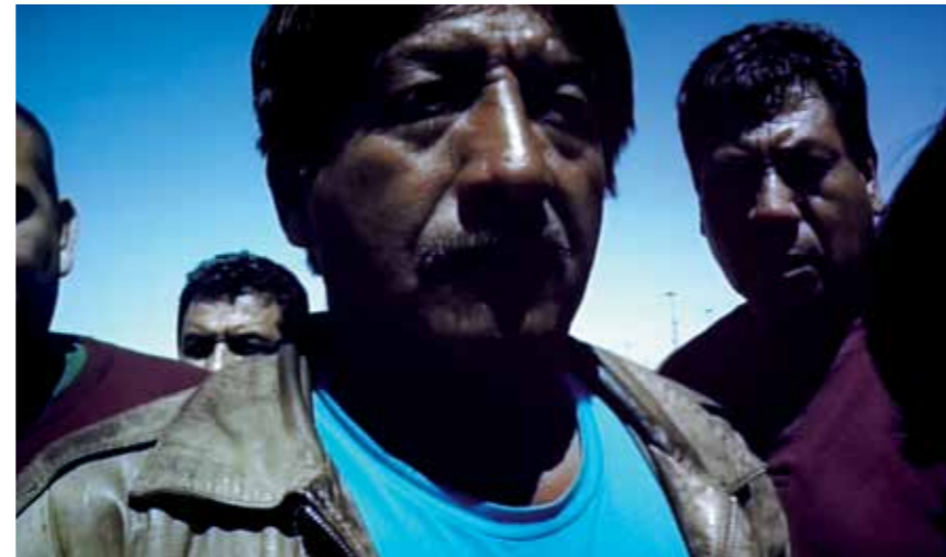
Adrian Paci Centro di permanenza temporanea (Temporary Detention Centre) , 2007 DVD video projection. Colour, sound. 5' 30". Variable sizes

truct a partial history of the Collection and the life of these pieces within its holdings, there would appear to be a proportional relationship between the exhibition career of a work and the volume of knowledge produced about it. The uncovering of these traces in the archive of the Collection demonstrates the repetition of normative readings, reproduced over and over again, which establish the interpretation of the work on the basis of its exhibition. In this closing off of its capabilities of utterance, the work loses its political potency and is transformed into a heritage object subject to its fetishizing as a commodity. Why, for example, have discourses such as those of Dean, Paci or Uriarte, images in which the crucial role of